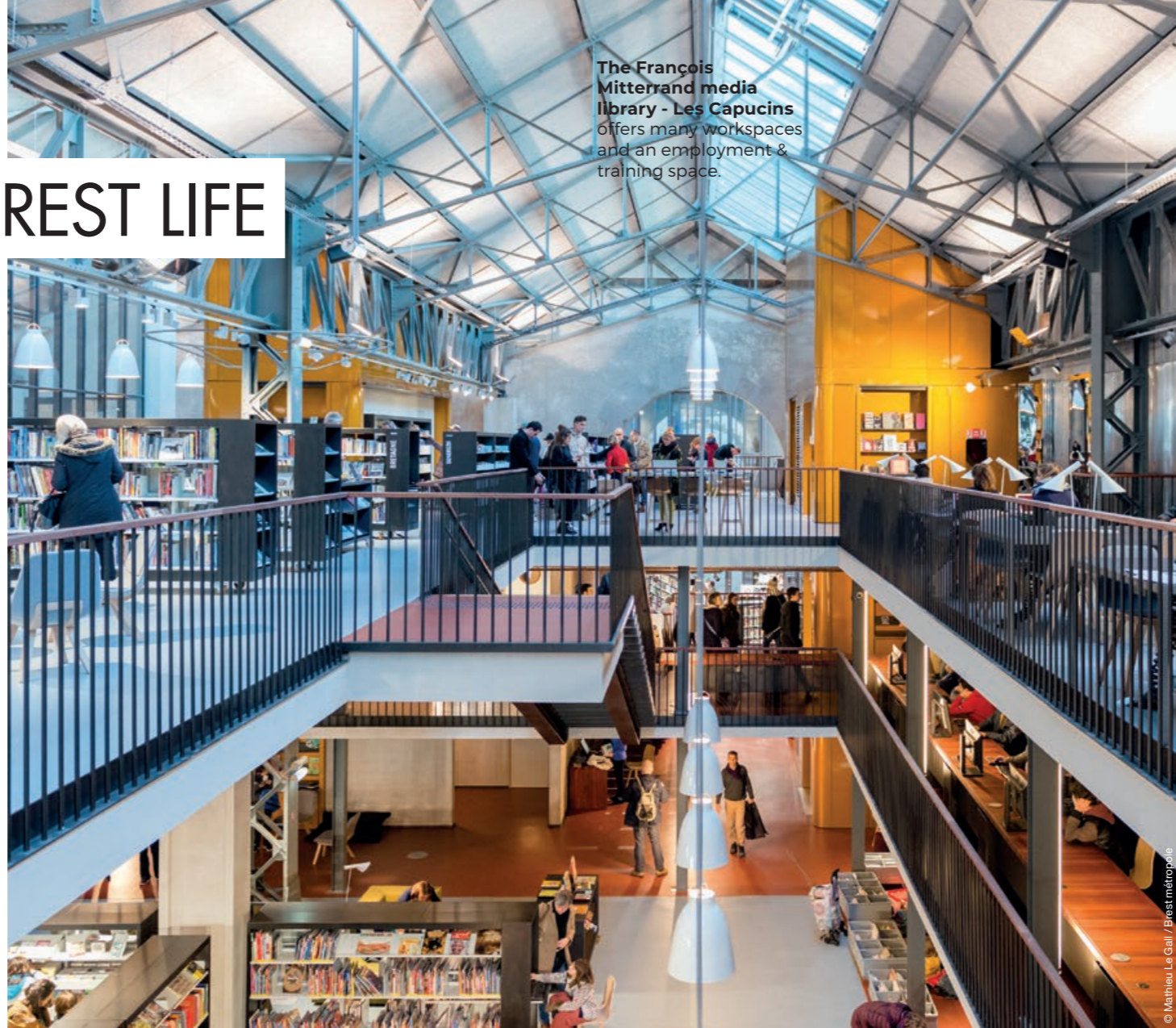
The François Mitterrand media library - Les Capucins offers many workspaces and an employment & training space.

Brest métropole and the city of Brest support a multitude of initiatives led by local associations and students. Guidance and assistance (financial, logistic ...) is provided to their initiatives. Here we commit, we invest and we create events that are free or truly accessible! For more information, contact the Mission for educative initiatives and youth at +33 (0)2 98 00 80 80 at the City Hall of Brest.