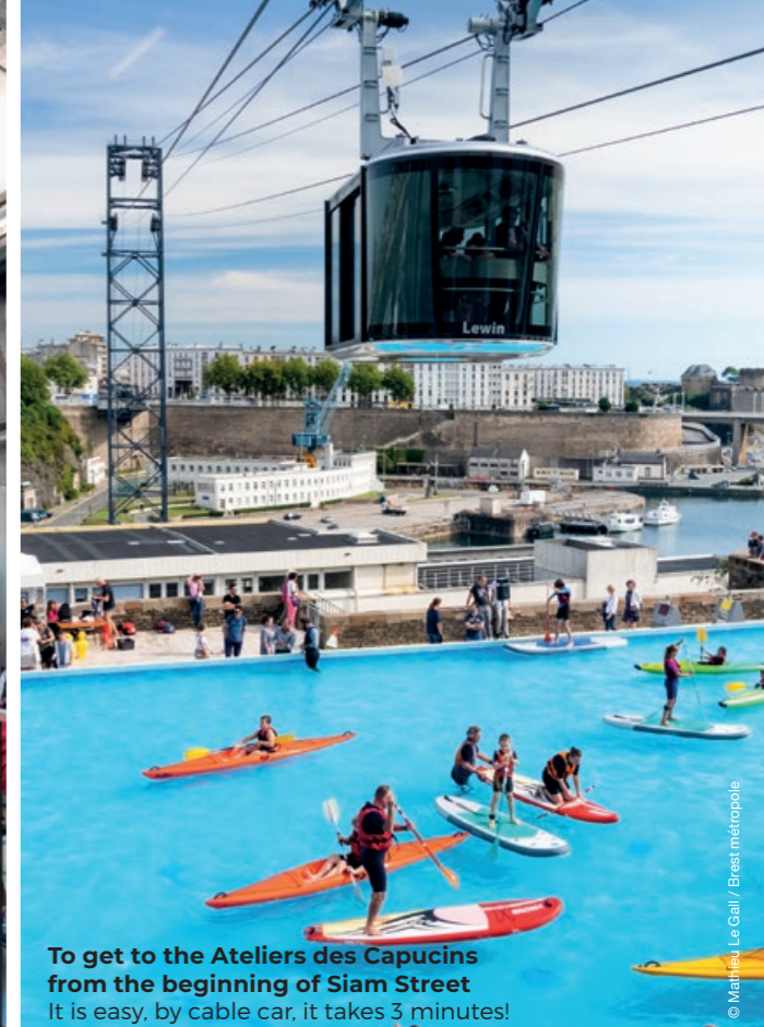
To get to the Ateliers des Capucins from the beginning of Siam Street it is easy, by cable car, it takes 3 minutes!