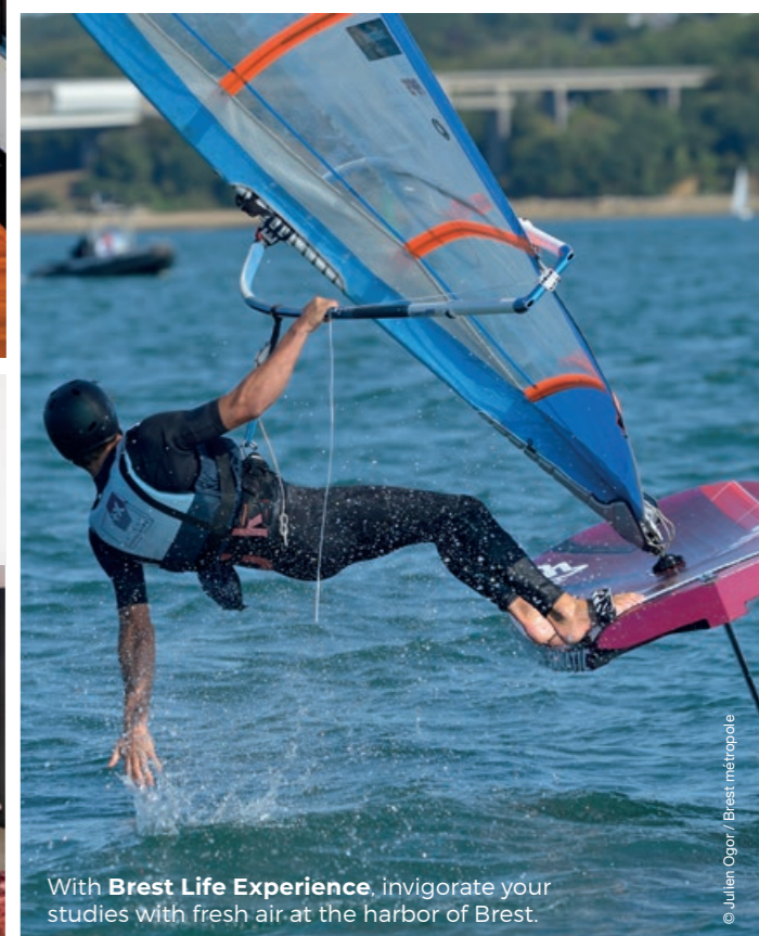
With Brest Life Experience, invigorate your studies with fresh air at the harbor of Brest.