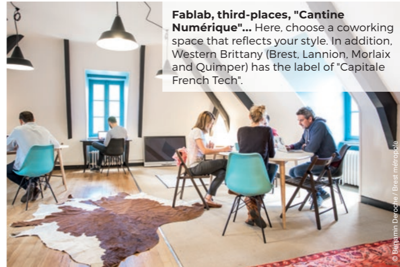
Fablab, third-places, "Cantine Numérique"... Here, choose a coworking space that reflects your style. In addition, Western Brittany (Brest, Lannion, Morlaix and Quimper) has the label of "Capitale French Tech".